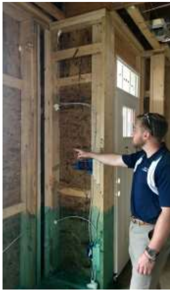
B. California Corners