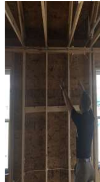
D. Stacking Effect