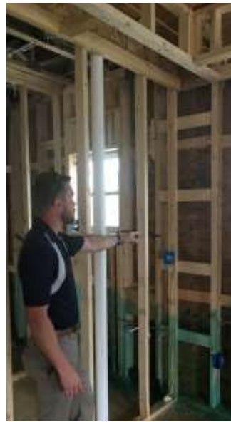
C. Ladder T-Walls